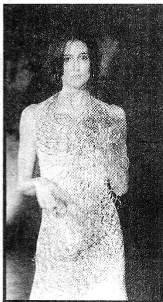
A model from Liz Larner takes to the catwalk.