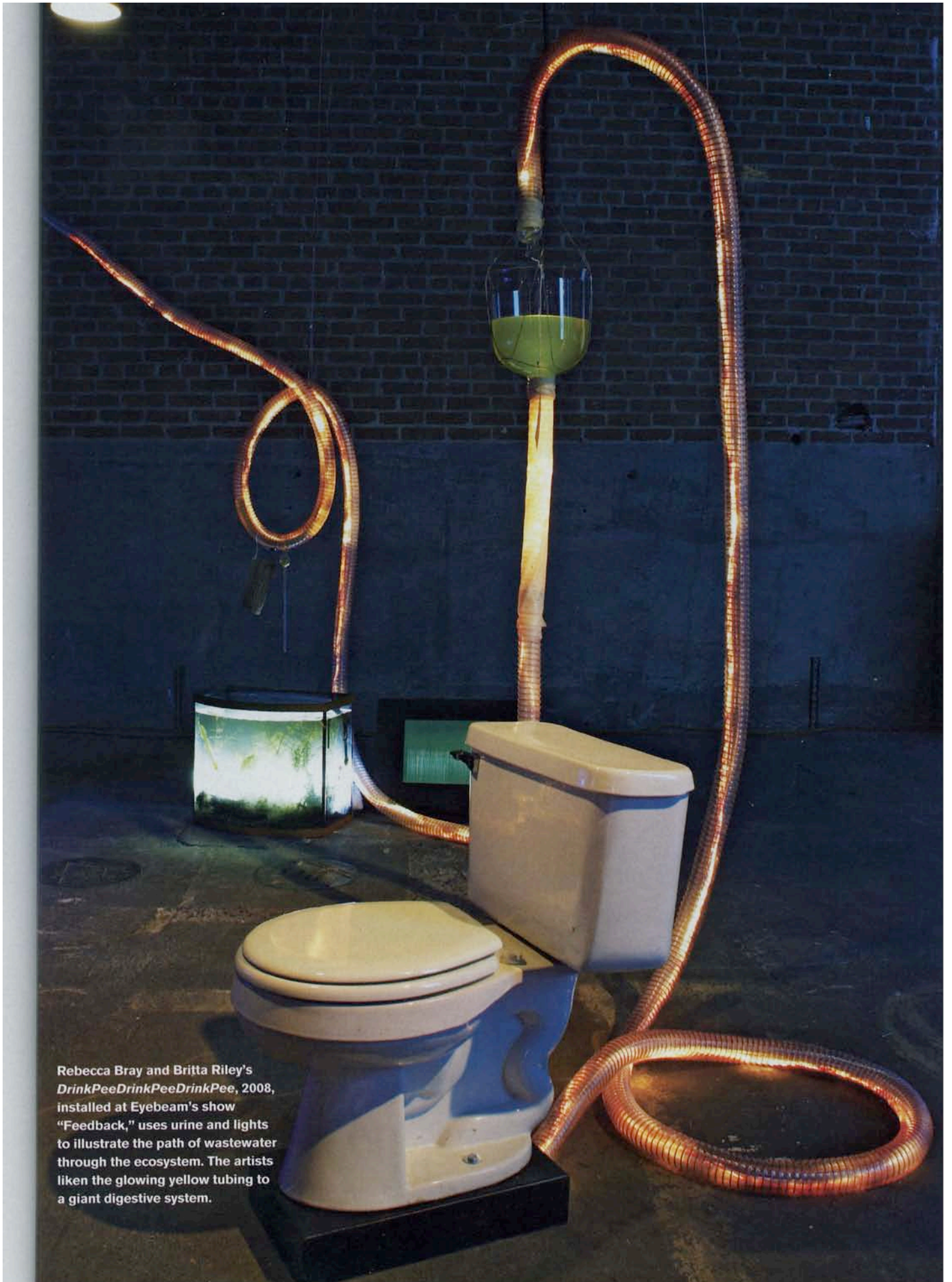
Rebecca Bray and Britta Riley's DrinkPeeDrinkPeeDrinkPee , 2008, installed at Eyebeam's show "Feedback," uses urine and lights to illustrate the path of wastewater through the ecosystem. The artists liken the glowing yellow tubing to a giant digestive system.