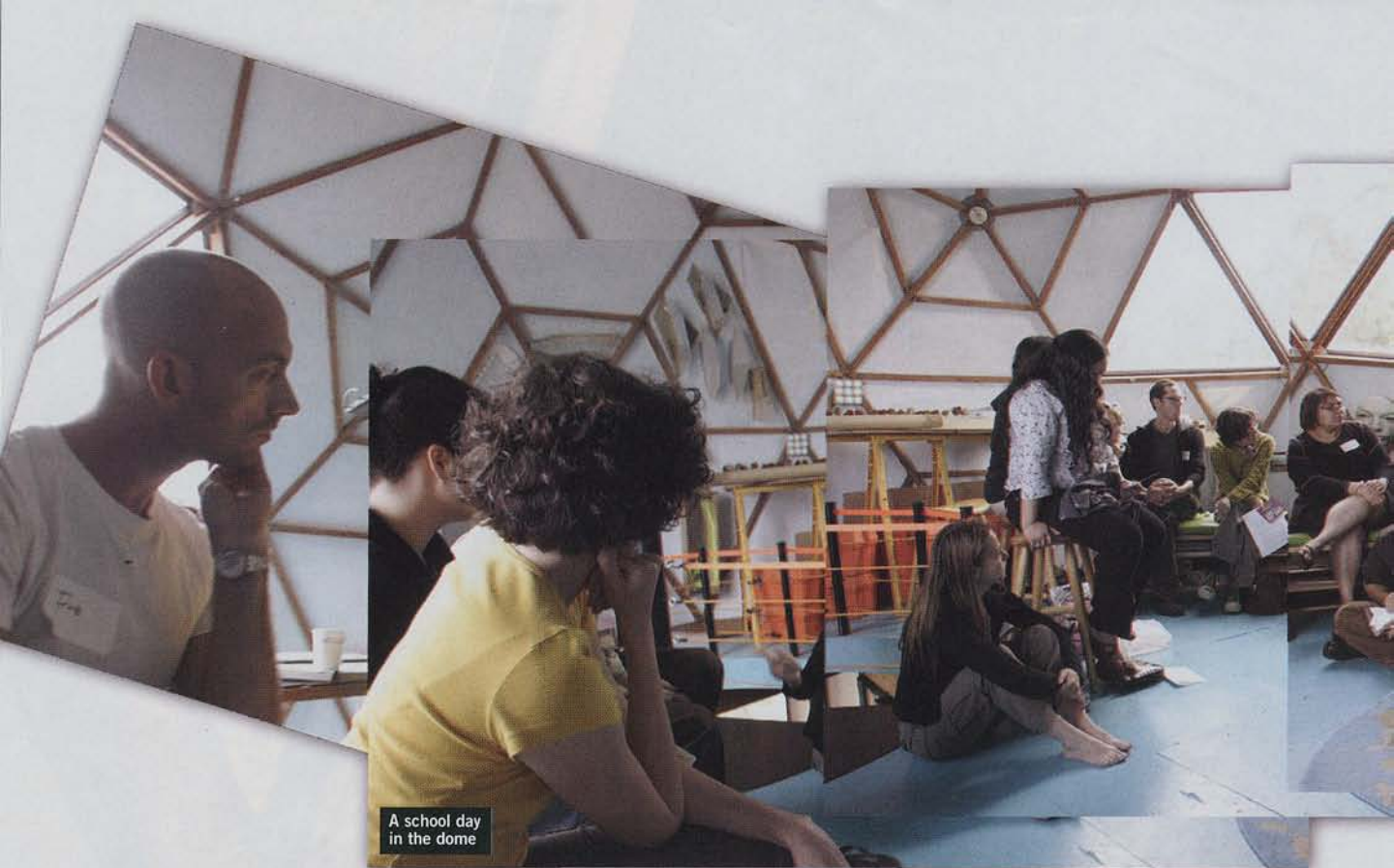
A school day in the dome