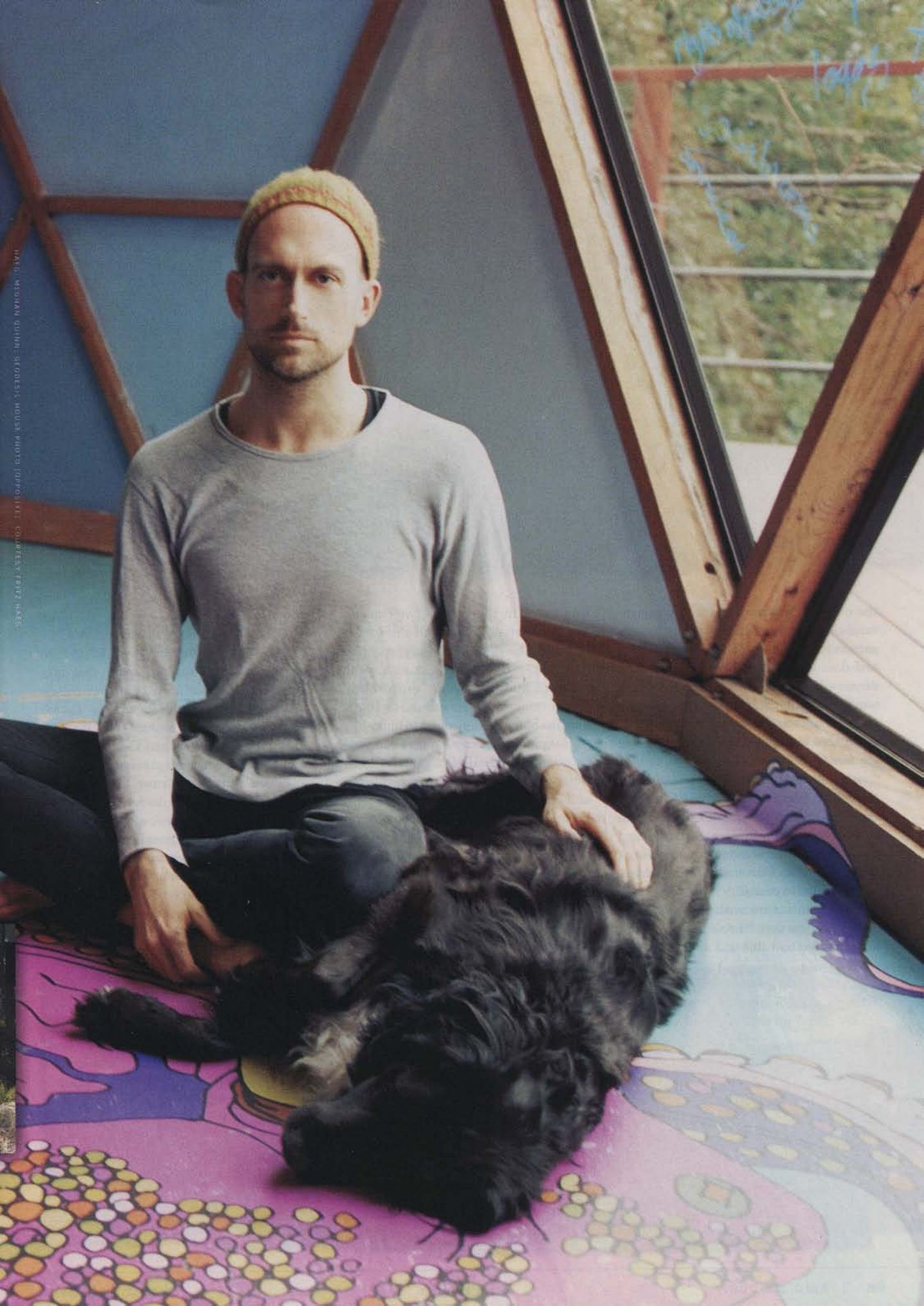
HAVE A MINDFUL ROUTINE? GET IDEAS FROM OUR PHOTO OPPORTUNITIES.