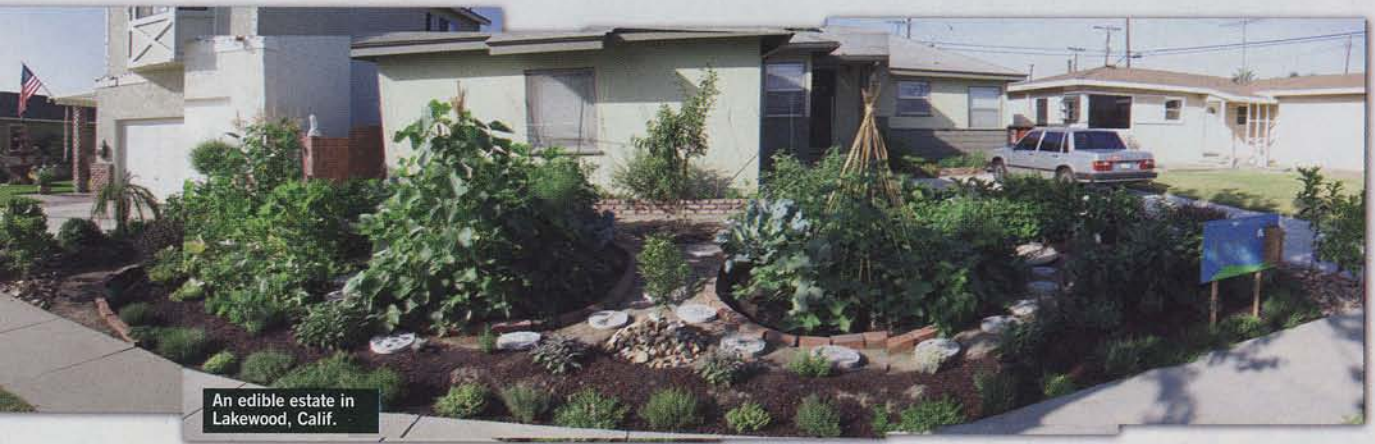
An edible estate in Lakewood, Calif.