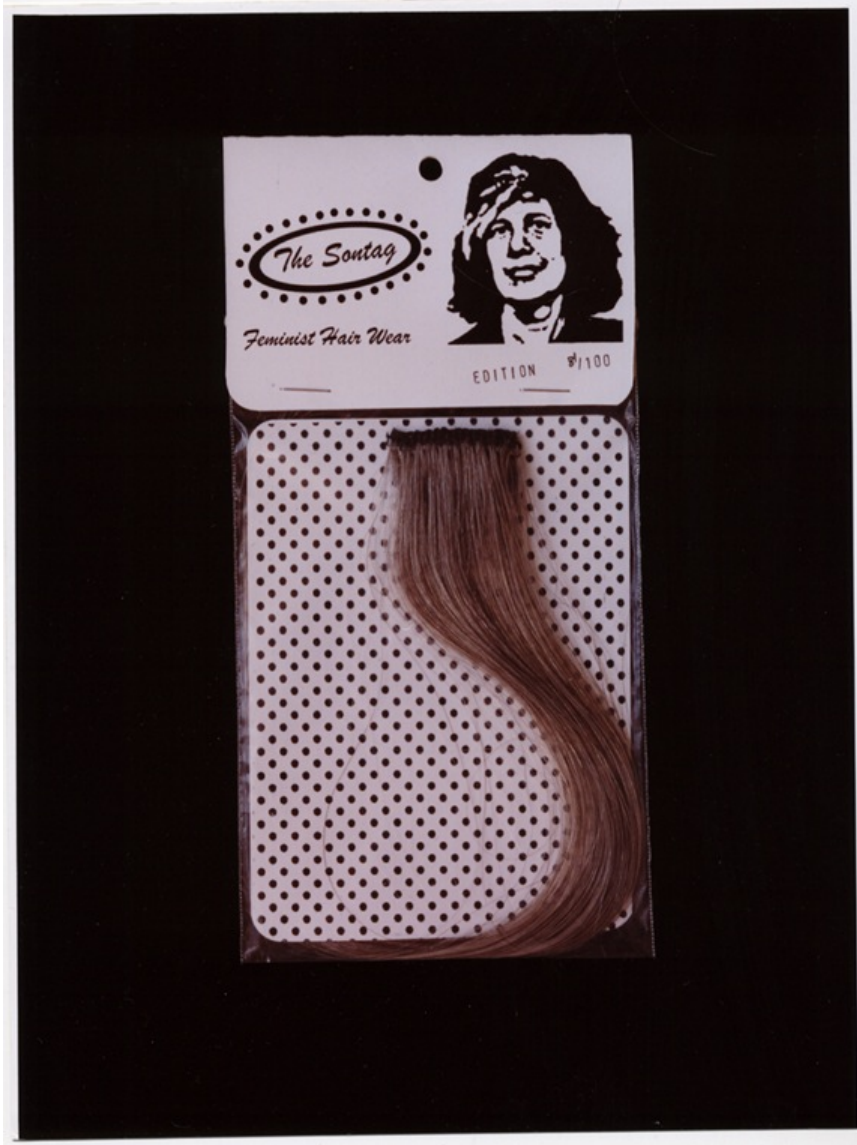
The Sontag , 2005, mixed media, 6" x 4"

A one inch, grey, clip-on hair extension. To be worn in memoriam.