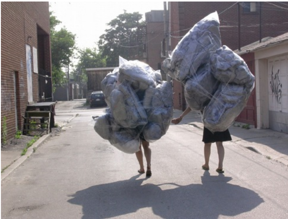
Burdensum , 2003, performance, collaboration with Day Milman Carrying bulbous packages of discarded packing material on our backs, we were stopped to talk about the physical and emotional burdens we carry with us.